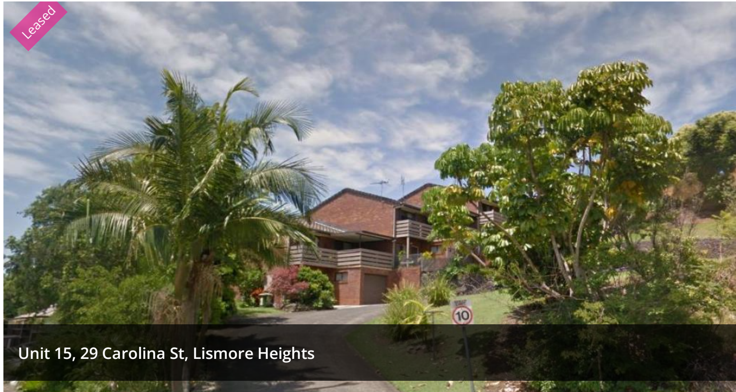
Unit 15, 29 Carolina St, Lismore Heights