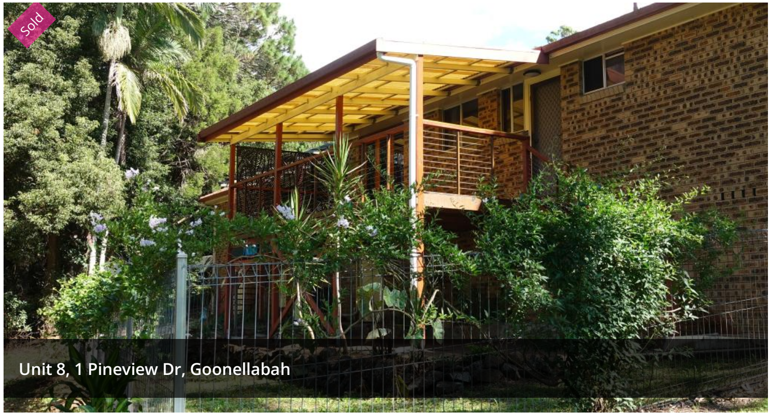
Unit 8, 1 Pineview Dr, Goonellabah