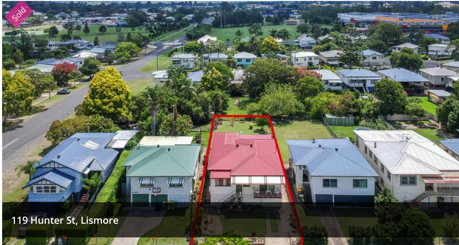
119 Hunter St, Lismore