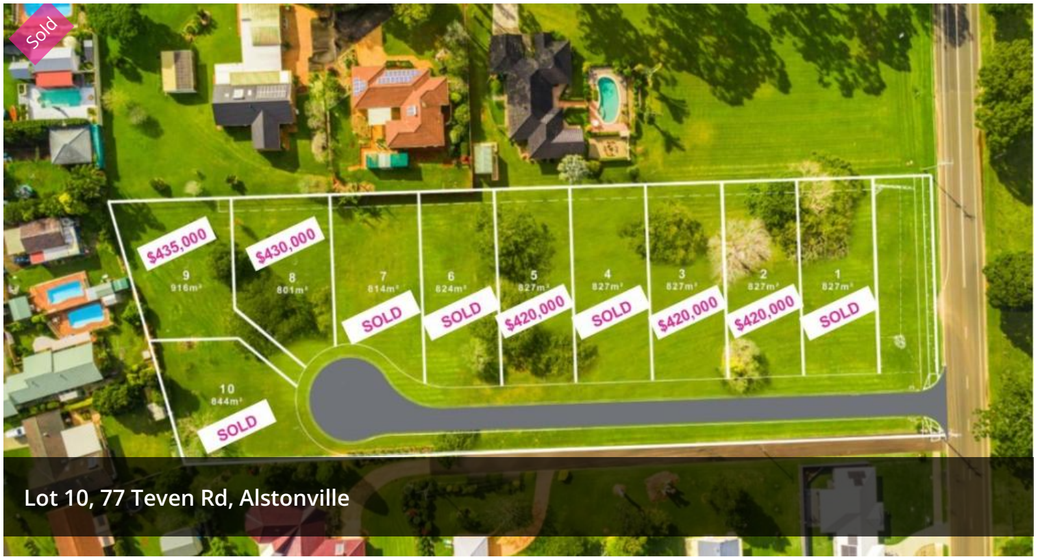
Lot 10, 77 Teven Rd, Alstonville